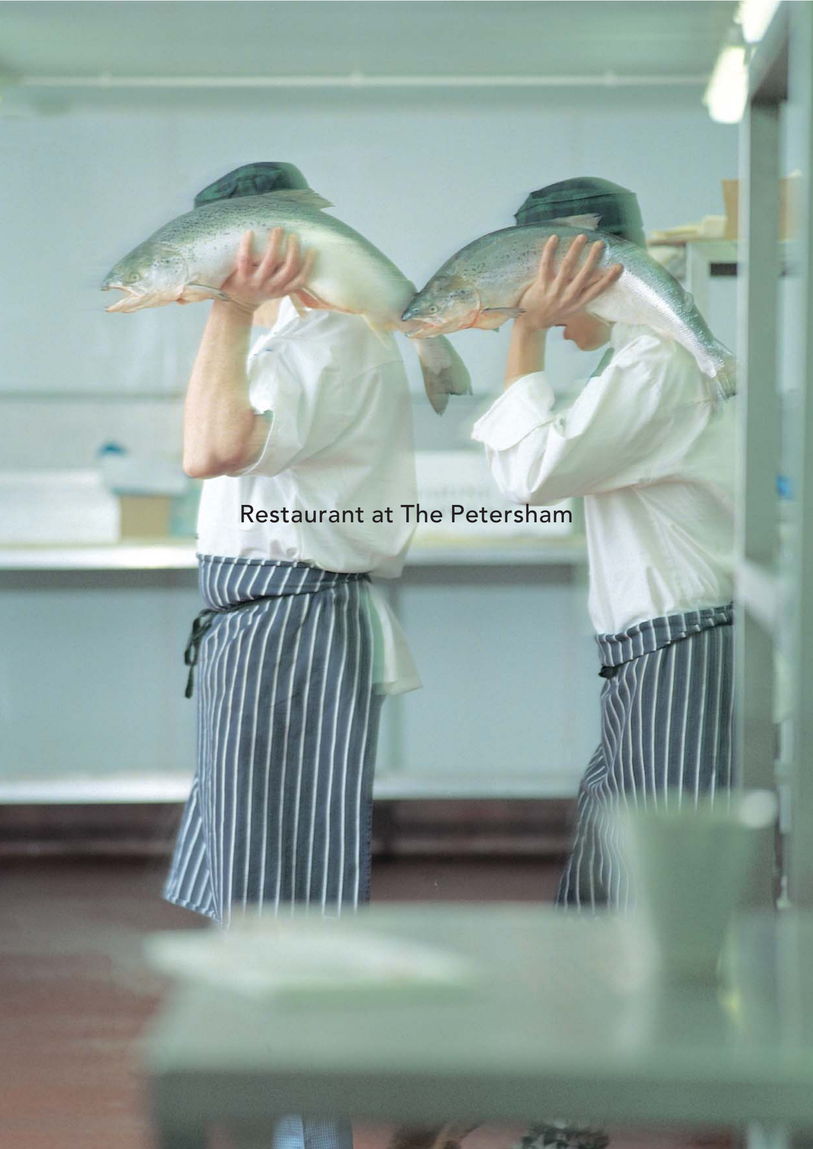
Restaurant at The Petersham